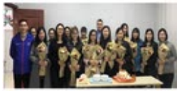
3.8 Women's Day party brought flowers and cakes for female employees. He is always so generous.